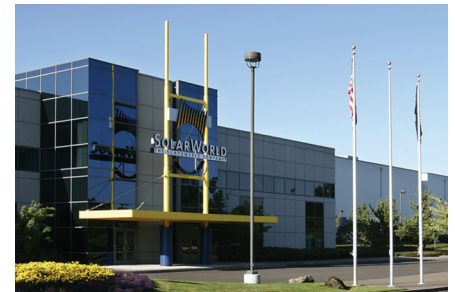
Crystal growing, wafering and cell production - Hillsboro, OR