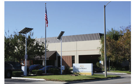
Module assembly and sales center for the Americas - Camarillo, CA