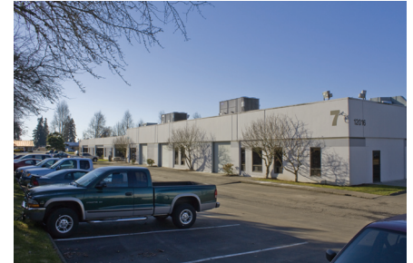
Silicon reprocessing - Vancouver, WA